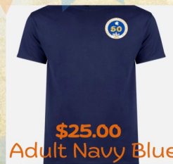
$25.00 Adult Navy Blue