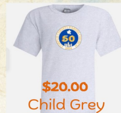
$20.00 Child Grey