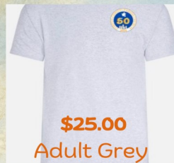
$25.00 Adult Grey